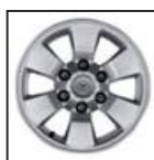
SR5 Standard 6-spoke 16" aluminum alloy wheel