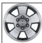
SR5 available 5-spoke 17" aluminum alloy wheel Limited standard 5-spoke 17" aluminum alloy wheel