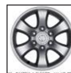
Sport Edition standard 6-spoke 17" aluminum alloy wheel