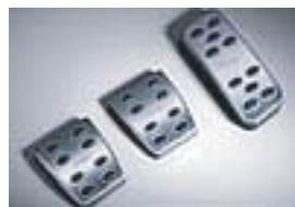
Sport Pedals $85.00 Installed MSRP*