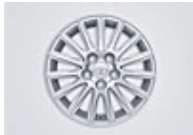
Alloy Wheels 16" 15 Spoke Aluminum $795.00 Installed MSRP*