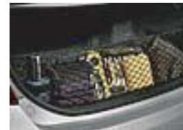
Cargo Net $49.00 Installed MSRP*