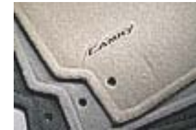
Carpet/Trunk Mat Set $199.00 Installed MSRP*