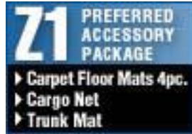
Preferred Accessory Package $277.00 Installed MSRP*