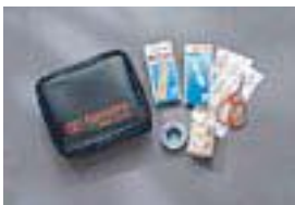
First Aid Kit $29.00 Installed MSRP*