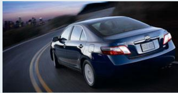
Hybrid shown in Blue Ribbon Metallic