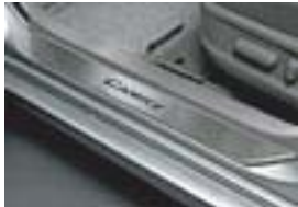
Door Sill Enhancements $159.00 Installed MSRP*