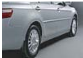
Body Side Molding $195.00 Installed MSRP*