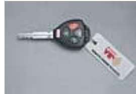
Remote Engine Start $595.00 Installed MSRP*