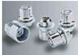
Wheel Locks $65.00 Installed MSRP*