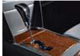
Sport Shift Knob $65.00 Installed MSRP*