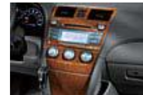
Dash Applique LE, CE (11 pc kit) $395.00 Installed MSRP* XLE (4 pc kit) $149.00 Installed MSRP*