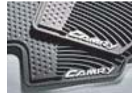
All Weather Mats $99.00 Parts Only MSRP**