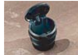
Ashtray $17.00 Parts Only MSRP**