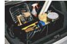
Cargo Tote $40.00 Installed MSRP*