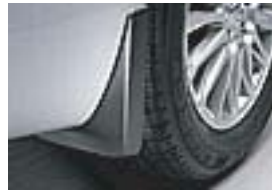
Mudguards $73.00 Parts Only MSRP**