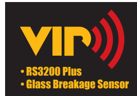
VIP Security Systems RS3200 Plus $359.00 Installed MSRP* Glass Breakage Sensor $247.00 Installed MSRP*