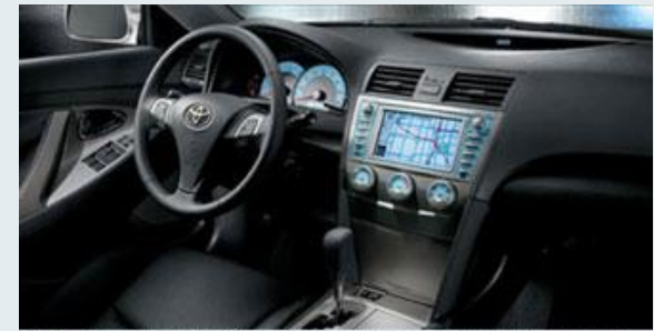
SE V6 interior shown in Dark Charcoal with available leather trim, heated front seats and voice activated DVD navigation system [10]