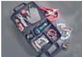
Emergency Assistance Kit $70.00 Installed MSRP*