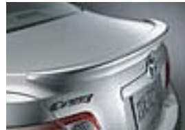
Rear Spoiler $295.00 Installed MSRP*