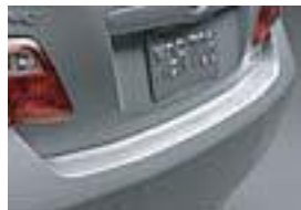
Rear Bumper Applique $49.00 Installed MSRP*