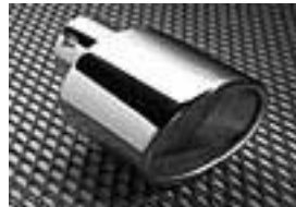
Exhaust Tip by Valor Manufacturing $85.00 Installed MSRP*