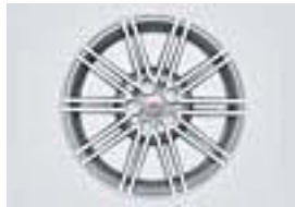
Alloy Wheel TRD 18" 10 Spoke (Includes four tires & wheel locks) $2,100.00 Installed MSRP*