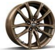
17-in. bronze-colored twisted-spoke alloy wheel 2