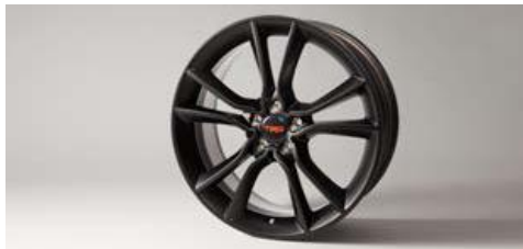
TRD 18-in. black alloy wheel 2