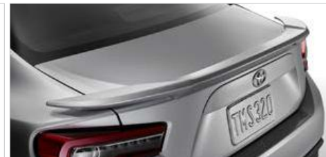
Rear lip spoiler