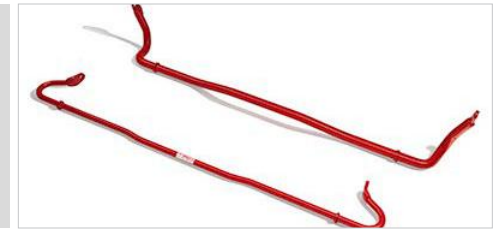
TRD sway bars