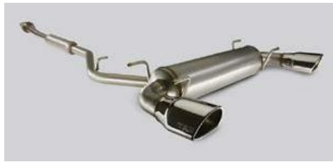
TRD performance dual exhaust