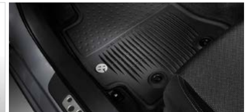
All-weather floor mats 10