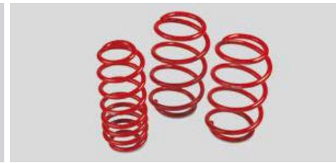
TRD lowering springs