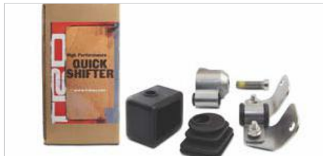
TRD quick shifter