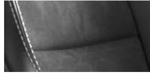
Black Granlux ®8 with leather trim