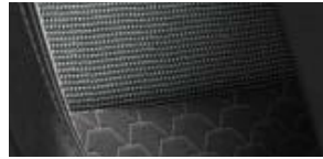
Black fabric with Granlux ®8 trim