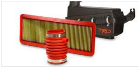
TRD air intake system

TRD performance dual exhaust TRD quick shifter TRD sway bar kit TRD sway bars Universal tablet holder 27