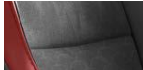
Black Granlux ®8 with Red leather trim