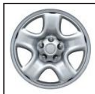
Standard 5-spoke styled steel wheel