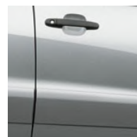
Titanium Metallic 2 with Gray interior