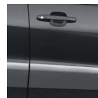
Graphite Gray Pearl 5 with Gray 4 interior