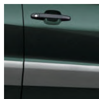
Rainforest Pearl 2 with Gray or Taupe 4 interior