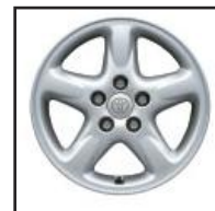
Available 5-spoke aluminum alloy wheel 3