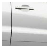
Frosted White Pearl 3 with Gray or Taupe 4 interior