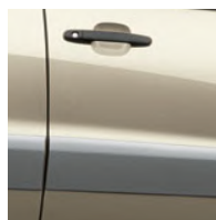
Vintage Gold Metallic 1, 2 with Taupe 4 interior