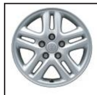
Available split 5-spoke aluminum alloy wheel 2