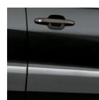
Black with Gray or Taupe 4 interior