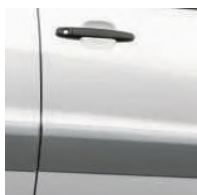
Natural White 1 with Gray or Taupe 2 interior