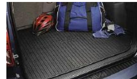
Cargo Tray $109 Installed MSRP*