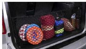
Cargo Net $49 Installed MSRP*