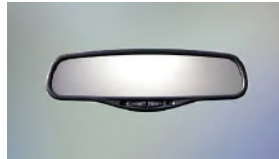
Auto Dimming Mirror $330 Installed MSRP*