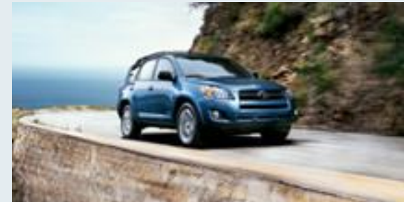
Sport shown in Pacific Blue Metallic