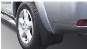
Mudguard $99 Installed MSRP*