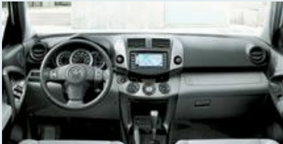
Limited interior shown in Ash with available Premium Package and touch-screen DVD navigation system [12]