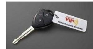
Remote Start $529 Installed MSRP*