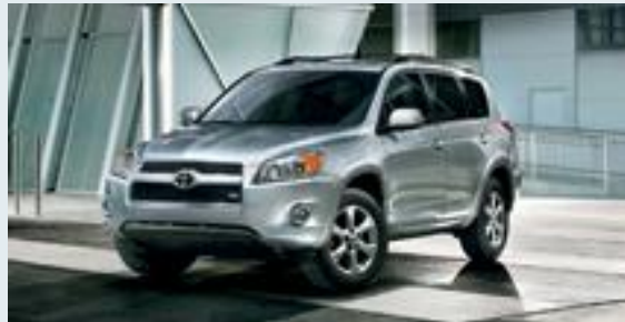
Limited V6 shown in Classic Silver Metallic