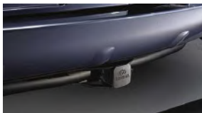
Towing Receiver Hitch without Tow Package $750 Installed MSRP*