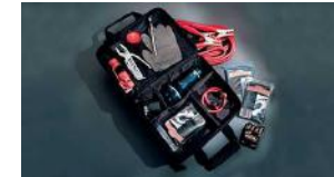
Emergency Assistance Kit $70 Installed MSRP*