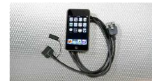
iPod® Interface $299 Installed MSRP*