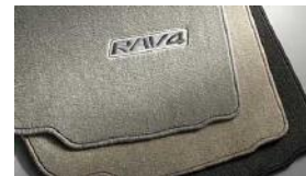
Carpet Floor Mats/Cargo Mat $199 Installed MSRP*