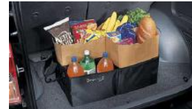
Cargo Tote $40 Installed MSRP*