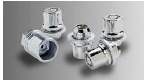
Wheel locks $81 Installed MSRP*