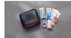
First Aid Kit $29 Installed MSRP*