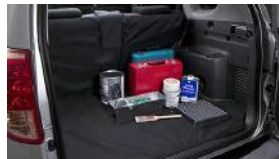
Cargo Liner $139 Installed MSRP*