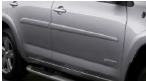
Body Side Moldings $199 Installed MSRP*