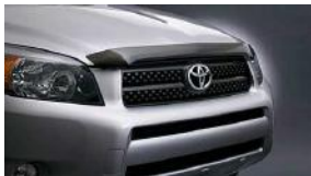
Hood Protector $135 Installed MSRP*