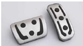
Sport Pedals by OBX Racing $85 Installed MSRP*