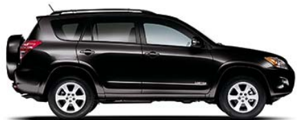
BLACK Ash, Sand Beige or Dark Charcoal 1,2 interior