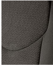
Sport fabric in Dark Charcoal