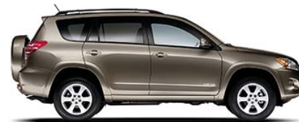
PYRITE MICA 4 Ash or Sand Beige interior