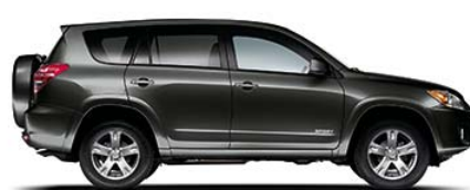
MAGNETIC GRAY METALLIC 1,2 Dark Charcoal 1,2 interior