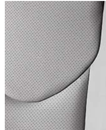
Limited leather in Ash