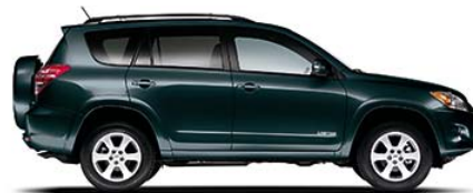
BLACK FOREST PEARL 3 Ash, Sand Beige or Dark Charcoal 1,2 interior