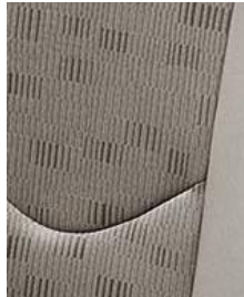
RAV4 fabric in Ash