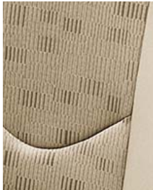
RAV4 fabric in Sand Beige