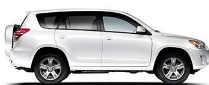
SUPER WHITE 1,3 Ash, Sand Beige or Dark Charcoal 1,2 interior