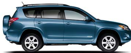
PACIFIC BLUE METALLIC 3 Ash, Sand Beige or Dark Charcoal 1,2 interior