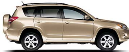
SANDY BEACH METALLIC 4 Sand Beige interior