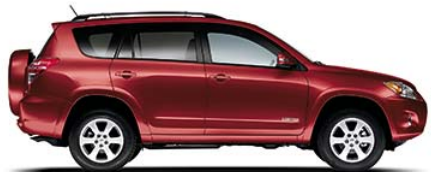
BARCELONA RED METALLIC Ash, Sand Beige or Dark Charcoal 1,2 interior