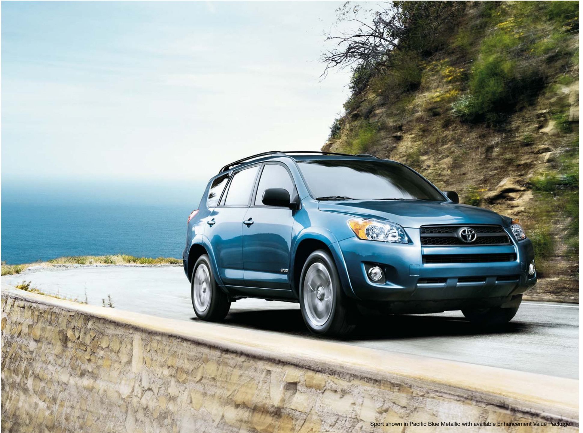
Sport shown in Pacific Blue Metallic with available Enhancement Value Package.