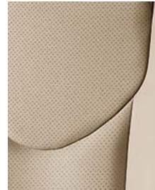
Limited leather in Sand Beige