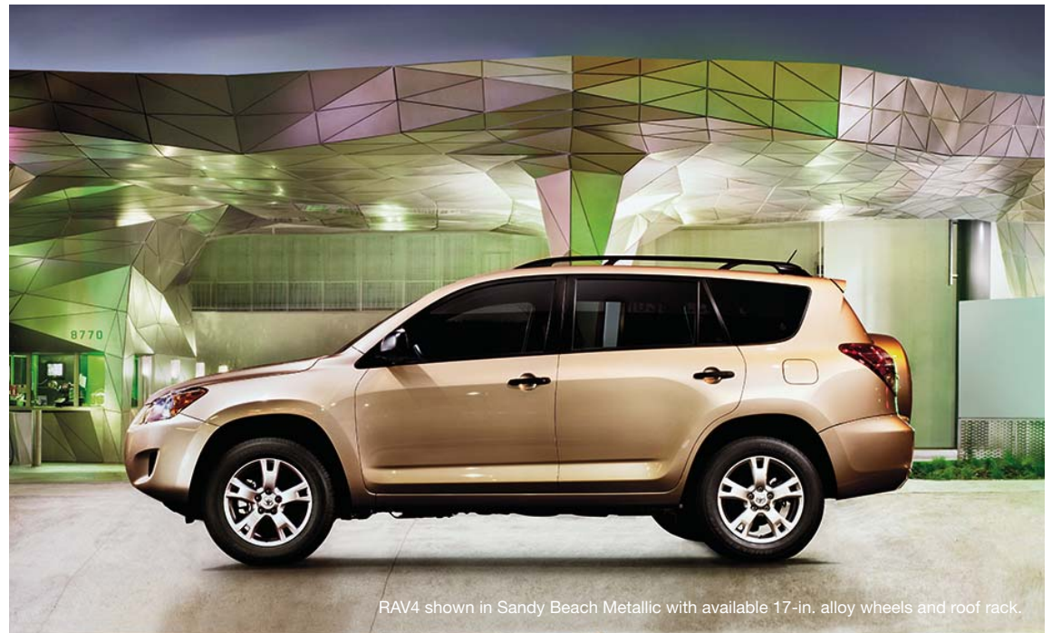
RAV4 shown in Sandy Beach Metallic with available 17-in. alloy wheels and roof rack.