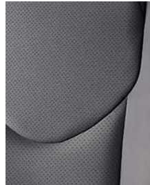
Sport leather in Dark Charcoal