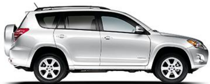
BLIZZARD PEARL 2,4,5 Ash or Sand Beige interior