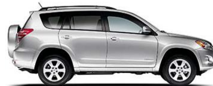
CLASSIC SILVER METALLIC Ash or Dark Charcoal 1,2 interior