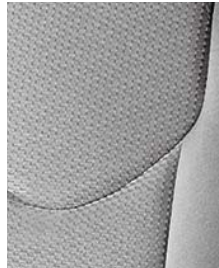
RAV4 available/Limited standard fabric in Ash