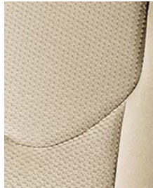
RAV4 available/Limited standard fabric in Sand Beige